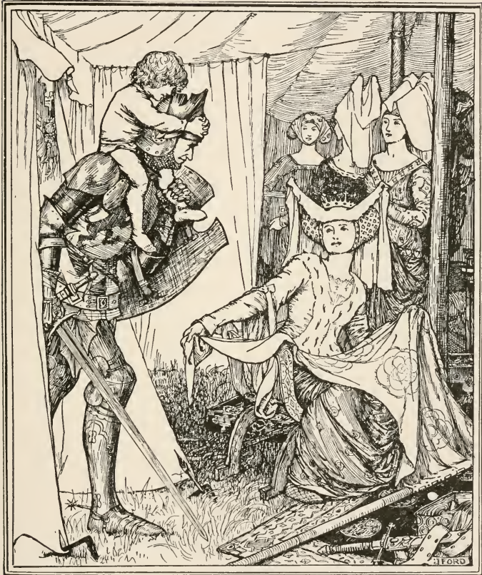
Herbert brings little Henry to his wife's tent

children there, lady Maud, who afterwards became the wife of the earl of Northumberland, and lady Katherine, to whom, many years later, he proposed marriage himself.